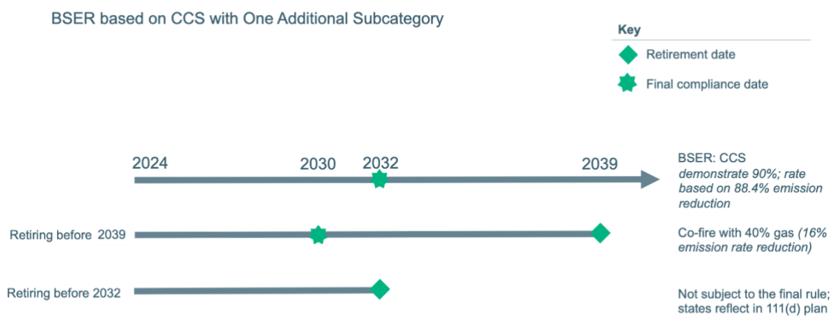
Figure 1. Final Existing Coal Standards

For existing coal-fired power plants, the final rule defines BSER as CCS with 90 percent capture of CO_2 .<sup>46</sup> For these units, the BSER results in a "degree of emission limitation equivalent to an 88.4 percent reduction in emission rate (lb CO_2 /MWh-gross)"<sup>47</sup> and the compliance deadline is January 1, 2032.<sup>48</sup> EPA states that CCS is an "adequately demonstrated technology that achieves significant emissions reduction and is cost-reasonable, taking into account the declining costs of the technology and a substantial tax credit available to sources."<sup>49</sup>